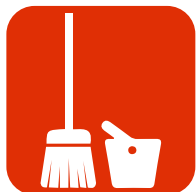
STAND CLEANING SERVICE