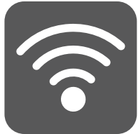
TELECOMMUNICATIONS AND NETWORKS