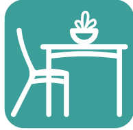
FURNITURE AND DECOR ELEMENTS